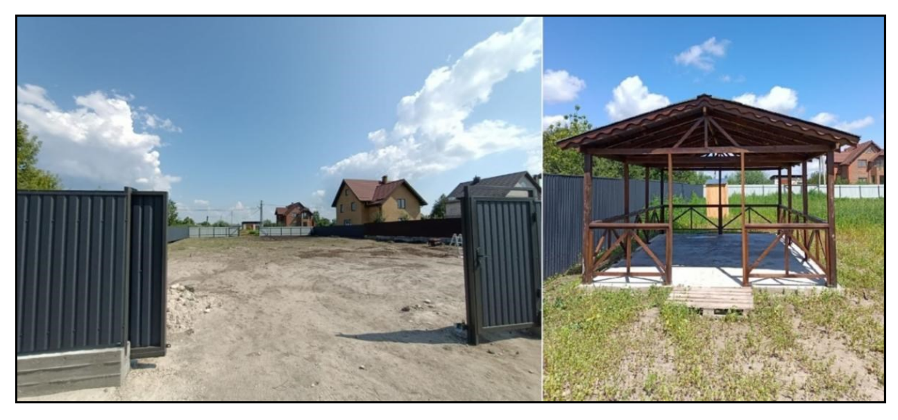
Land recently purchased in the Kyiv region to be used for shelter for the elderly and disabled. With help from St. Peter's.

New acquaintances from <u>St. Peter's Evangelical Lutheran Church - North Wales</u> support our ministry with the beginning of hostilities. Thanks to their donations, we managed to purchase a plot of land in the Kyiv region and partially support 2 social workers in 2023. Preparatory works have been completed on the plot of land. The start of construction of the Shelter for the elderly and disabled is planned for the end of 2024. We really hope that our American friends will have an opportunity to visit Ukraine.