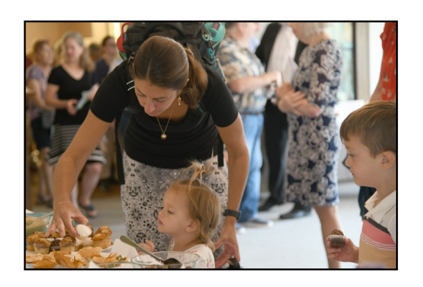
Congregants enjoy sampling eastern Mediterranean food on a Sunday morning. The service was dedicated to prayer for the people of Syria & Turkey hit hard by an earthquake earlier this year.