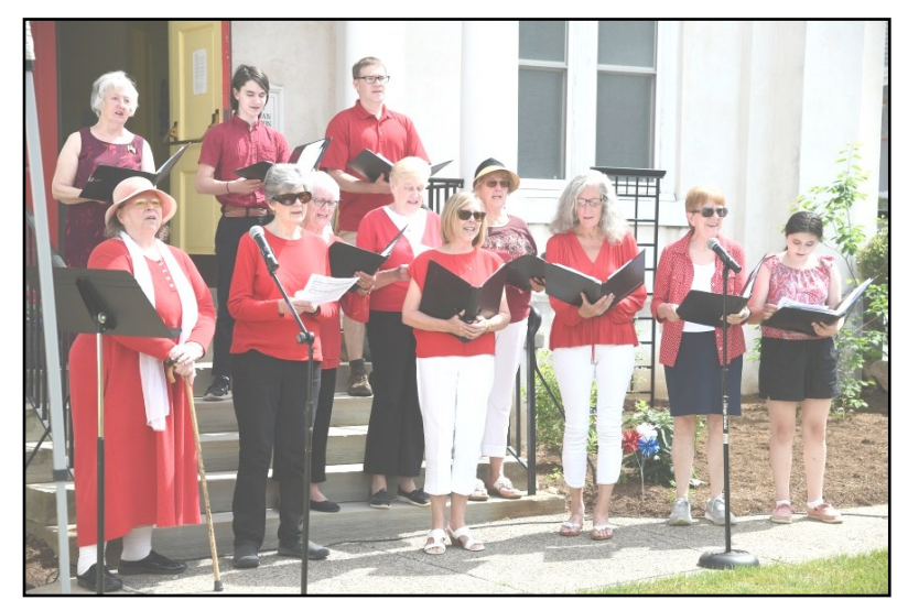
St. Peter's Choir sings at our first summer service outside on the lawn on Pentecost.