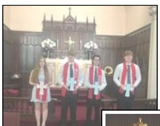
The Confirmation Class of '23.