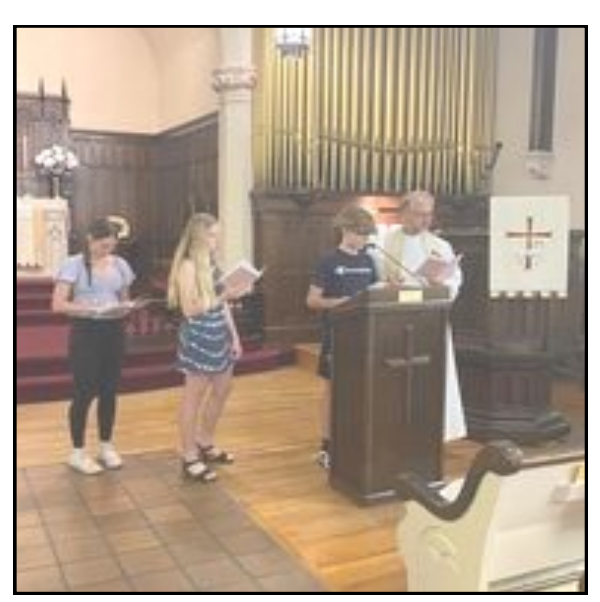
Students from the Confirmation Class of '24 assist in this year's Confirmation Ceremony.