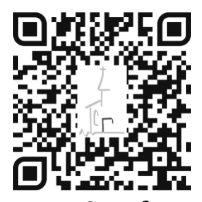
Scan for Online Giving