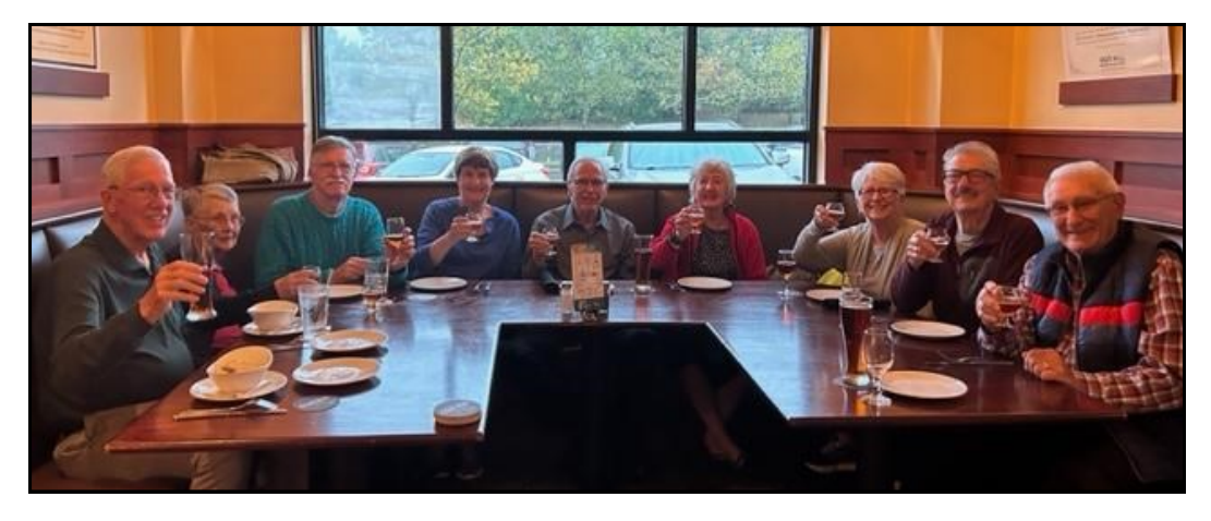
St. Peter's members enjoy dinner at the Iron Hill Fundraiser for Sanctuary Village Tiny Home Community in Philadelphia.