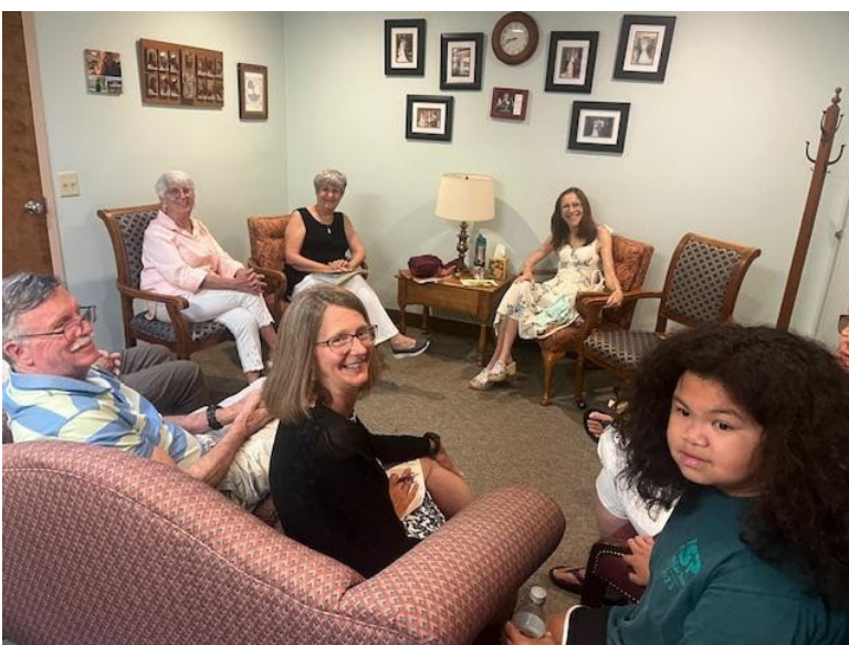
The Green Team