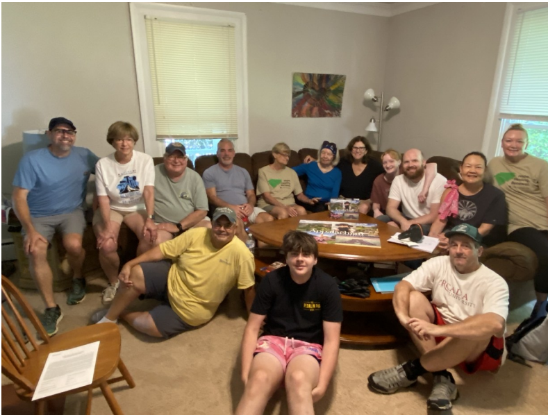
NC Mission Trip Volunteers