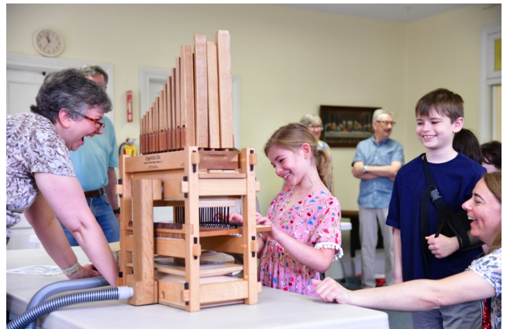
Playing the organ is fun!