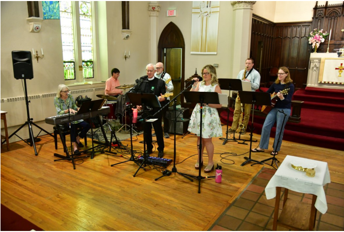
A Common Thread